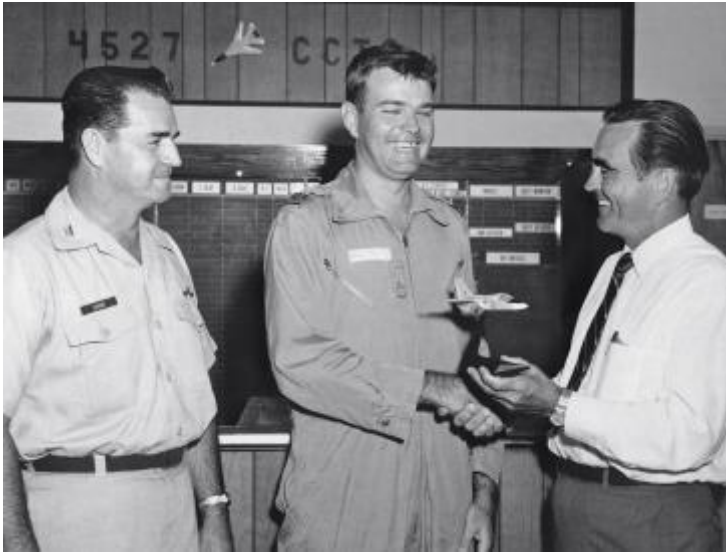
Receiving F111 Model presents after first Flight, Nellis AFB, 22 Jul 68

I was involved in F-111C Operations; both in 1968 when we came back from the USA "empty-handed, and again on the first Ferry in 1973.