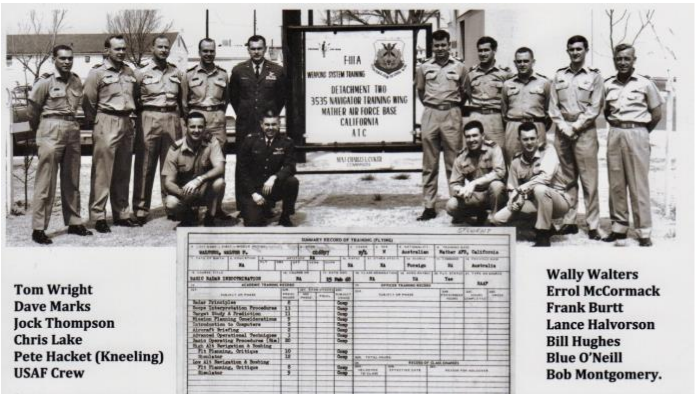
This photograph relates to RADAR Training at Mather AFB (near Sacramento, California), before proceeding over to Cannon AFB in New Mexico where we completed Weapon Systems Training.