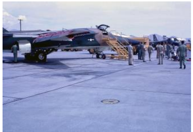
F111 Flight Line during Aussie first Flights, Nellis AFB, 22 Jul 68