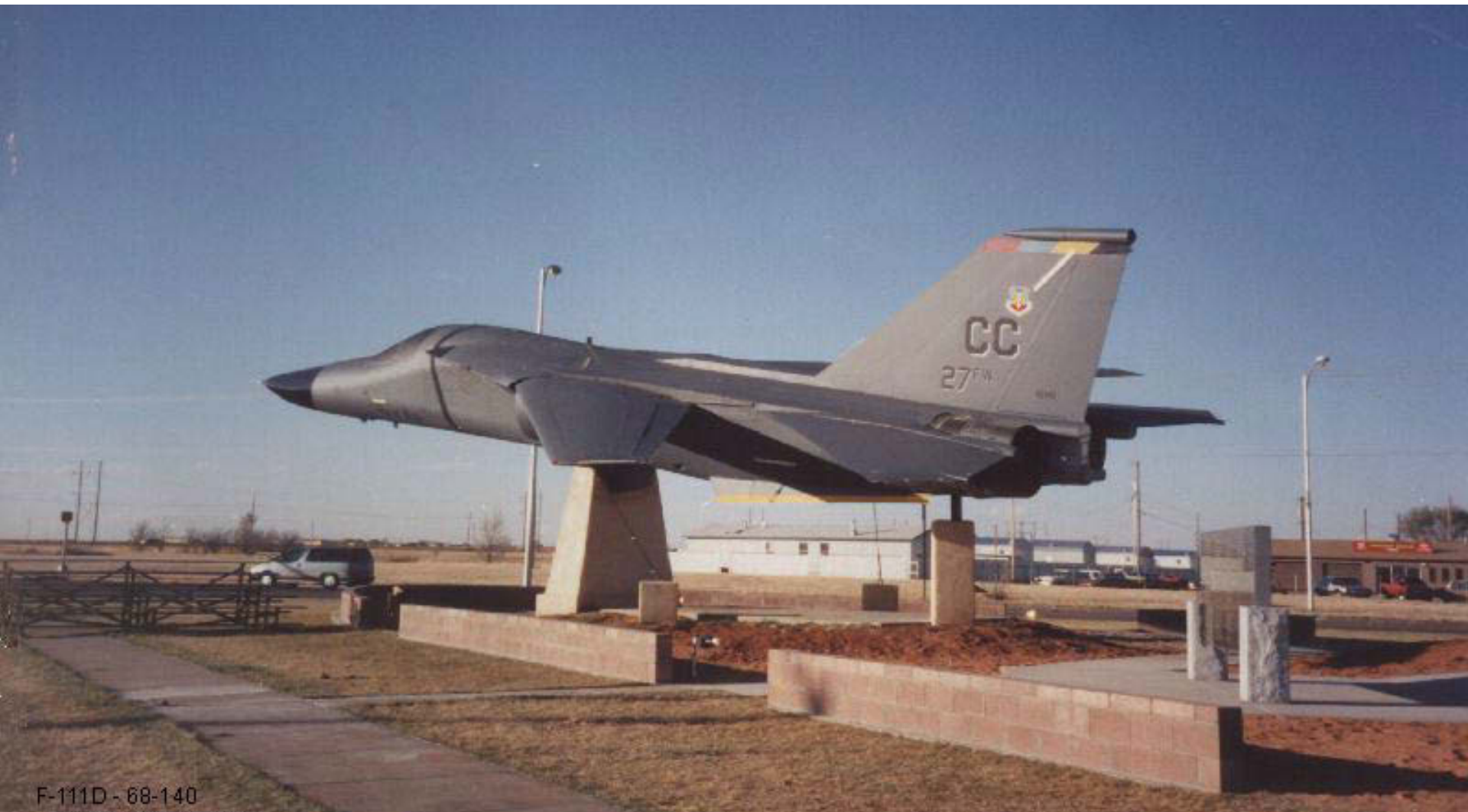
F-111D - 68-140